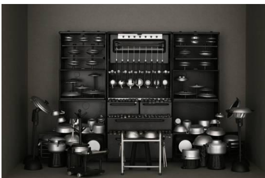
Donna Ong In the Secret, in the Quiet Place (v) 2008 enamel paint, miniature plastic toys, miscellaneous plastic items 44 x 37 cm