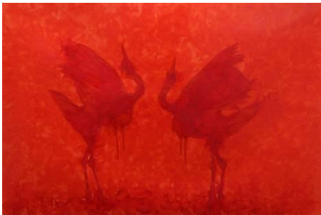
Pradeep Mishra warmthoftogetherness 2010 oil paint, paper 138 x 209 cm