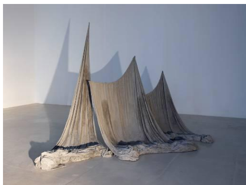
Thiago Rocha Pitta Monument to the Continental Drift 2012 cement on canvas 170 x 250 x 100 cm (reference image)