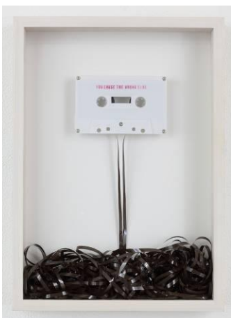
Duto Hardono Untitled (You Chose the Wrong Side) 2011 framed hand stamped cassette tape 36.0 x 21.2 cm (reference image)