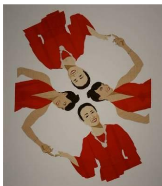
Mary Elizabeth Yarbrough I am glad that I meet you! 2007 duct tape and contact paper on contact paper 63 x 56 cm