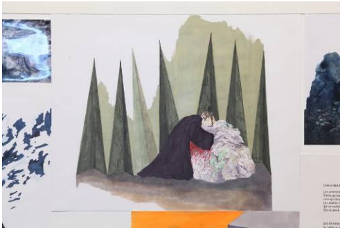
Florencia Rodrigues Giles Fictional Islands 2009 pencil, marker-pen, watercolor, paper, photograph prints 100 x 100 cm (Installation size) (partial view, reference image)