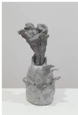
Erika Verzutti Carbonada 2010 concrete, glass beads 32 x 13 x 13 cm