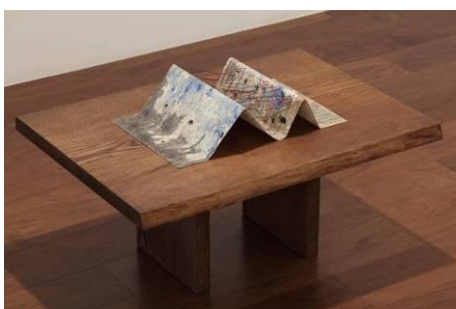
Minam Apang Hillside Stories: Neri and Yomi 2009 cotton thread, synthetic glue, 400 gsm fabriano cold press archival paper, ash wood table 26 x 56 x 8.5cm (paper work); 35 x 70 x 35cm (table)